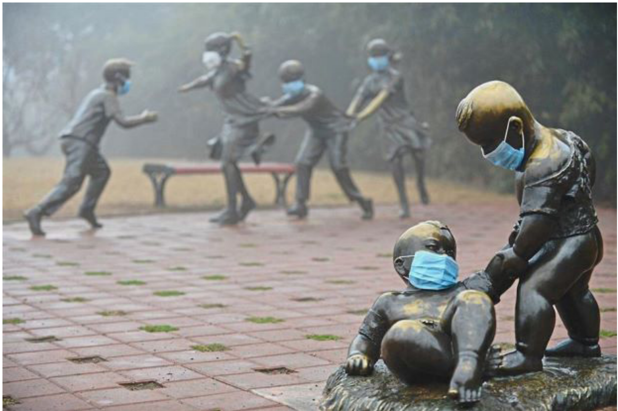
Masks placed on sculptures in park on a hazy day to highlight pollution woes in Pyang, Beijing, Unknown Artist.