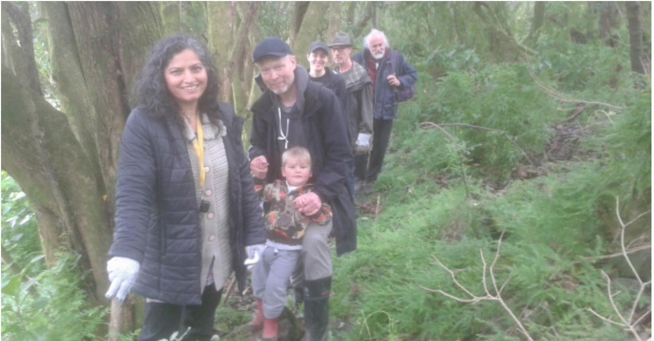
Waititiko-Water of Periwinkles.