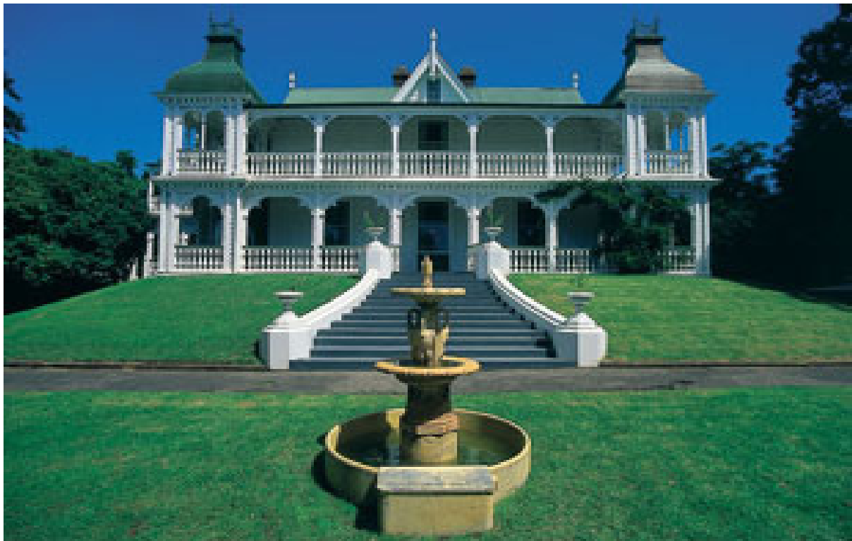
Alberton House, 2015.